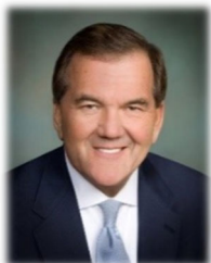
Tom Ridge, Chairman, Ridge Global

Tom Ridge is Chairman of Ridge Global. He provides clients with solutions to cyber security, international security and risk management issues. Following the tragic events of September 11th, 2001, Ridge became the first Assistant to the President for Homeland Security and, on January 24, 2003, became the first Secretary of the U.S. Department of Homeland Security.